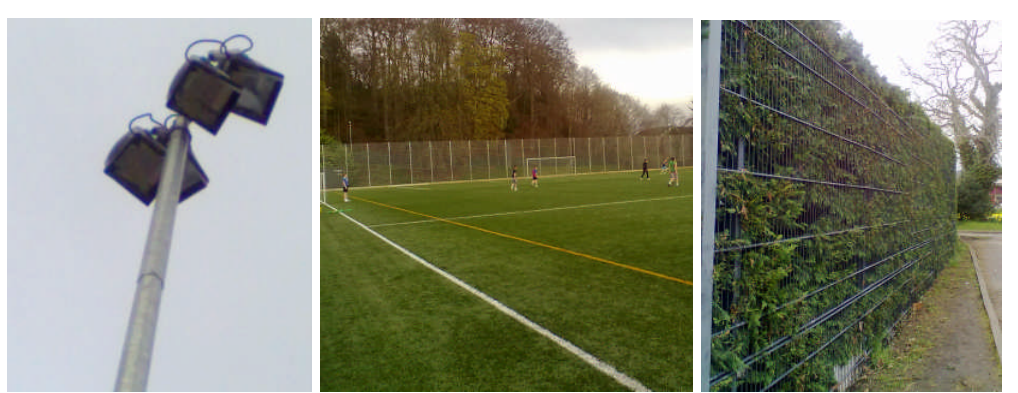
Fig. 5, 6 & 7- Lighting columns, pitch surface and hedging examples

5. A series of 16m high lighting columns (8no.) would be located around the pitch and be positioned to minimise glare and light pollution. A Lighting Impact Assessment has been provided to demonstrate the likely impact. The hours of operation would also be closely controlled and agreed by a community management committee. Finally, a steel storage container would also be located to the side of the pitch to house maintenance and sports equipment. Amendments have been agreed to clad this with timber linings to soften its appearance and be more in keeping with the new school.