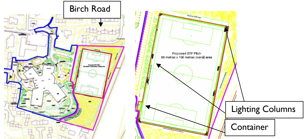
Fig. 2 & 3 - Synthetic pitch location and layouts (66m x 106m)

I. Planning permission is sought to install an 'all weather' synthetic pitch, along with security fencing, floodlights and a storage container at the new Community Primary School, currently being constructed at Birch Road, Aviemore. This would be in lieu of a proposed grass pitch (see 08/433/CP and 10/153/CP latterly approved 10 August 2010 – Appendix I approved site plan). Work is well underway on the building, associated access roads and its car park with completion expected in May 2012. An area of birch semi-natural woodland has been clear-felled in preparation for the formation of the pitch to the north east and is currently being utilised as a contractor's compound and car park. (N.B. it should be noted that a greater area has been felled than planning permission had been granted for).