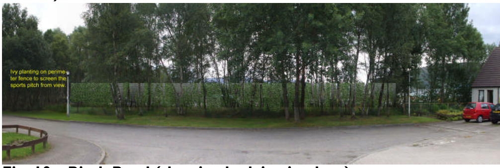
Fig. 10 - Birch Road (showing hedging in place)