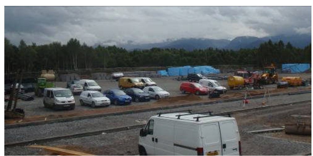
Fig. 4 - Site area

2. The adjacent area is predominately residential in nature, interspersed with areas of woodland and trees, notably to the east beyond the railway line. The closest dwellings are located at Birch Road directly to the north (see fig. 2). A small number are 10m away, but do not face toward the site (gable end only). A total of 9no. properties face directly toward the proposed pitch area, with the closest being 40m away. A 15m birch tree buffer partially screens the site (see figures 8&9).