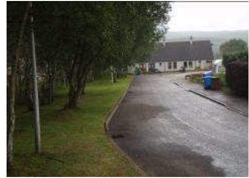
Fig. 8 & 9 – Birch Road (showing current relationship and outlook to site)